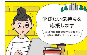
New Financial Support System for Higher Education