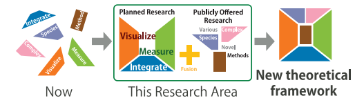
Figure 4. A conceptual drawing of "Photosynthesis Ubiquity" research by integration

In the "Integrating" research, we will focus on the evolution of "regulatory systems" that control molecular devices that support environmental adaptation from comparative genomic analyses and AI-based prediction of key photosynthetic supramolecular complexes. This research will serve as a link between the functional and structural analysis and the principle of environmental adaptation.