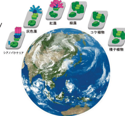
Principle that enables photosynthesis all around the globe?

Based on recent researches, it is suggested that photosynthetic organisms have kept the core apparatus but diversify their regulatory/accessory components to adapt to specific light conditions by forming various "supramolecules" of core and regulatory/accessory proteins. In other words, it is important to understand the environmental adaptation of photosynthesis based on the formation of various types of supramolecules. However, it has not yet been possible to link the dynamically formed supramolecules and the physiology of photosynthetic organisms. Therefore, researchers in structural biology and plant physiology/biochemistry, and informatics scientists in this research area tackle to elucidate the principles of how supramolecules accomplish diverse physiological functions on different time and spatial scales.