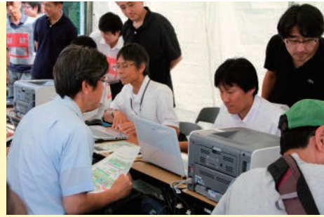
Certificates were issued in the comprehensive disaster drill conducted by the Tokyo Metropolitan Government on September 1, 2012.

After the GEJE, the system was used in Iwate Prefecture. The system was also utilized in the City of Uji, Kyoto Prefecture, in FY2012 when the city was hit hard by a typhoon and heavy rain. It was also used in the Cities of Kyoto and Fukuchiyama, Kyoto Prefecture, and the Town of Oshima, Tokyo, in FY2013, in supporting relief of disaster victims. The system helped ensure prompt issuance of victim's certificates and prevent failure and delay in the payment of benefits to victims, thus contributed to early relief of victims.