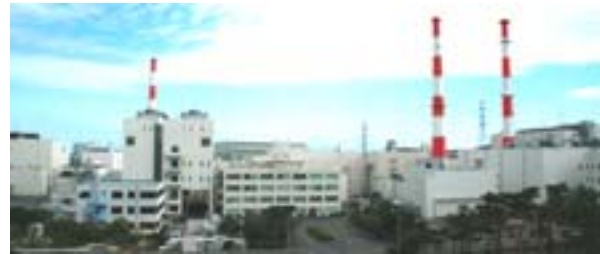
Tokai reprocessing facilities

Since Japan relies on imports for most of its energy resources, the government has steadily promoted efforts to establish the nuclear fuel cycle through effective utilization of recovered plutonium, etc., from the reprocessing of spent nuclear fuel, in order to secure long-term energy supply stability in view of future energy supply and demand throughout the world.