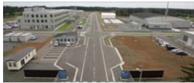
International Fusion Energy Research Center (Rokkasho, Aomori)