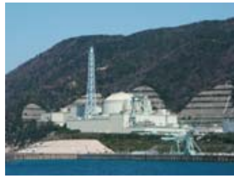
Prototype Fast Breeder Reactor “Monju” (Tsuruga, Fukui)

Research, development, and utilization of atomic energy in Japan have been conducted according to the Atomic Energy Basic Act (enacted in December 1955), “solely for peaceful purposes, based on the premise of ensuring safety.” The government has been implementing the research, development and utilization of nuclear energy based on the “Framework for Nuclear Energy Policy” (October 2005) and the “Basic Energy Plan.” The nuclear energy in Japan accounts for approximately 30% of total energy consumption today.