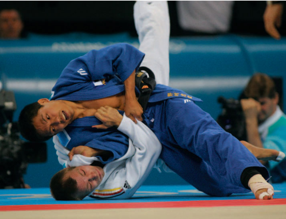
Tadahiro Nomura, men's judo 60-kg gold medalist, became the first judo man to win a third consecutive gold medal at the Olympic Games.