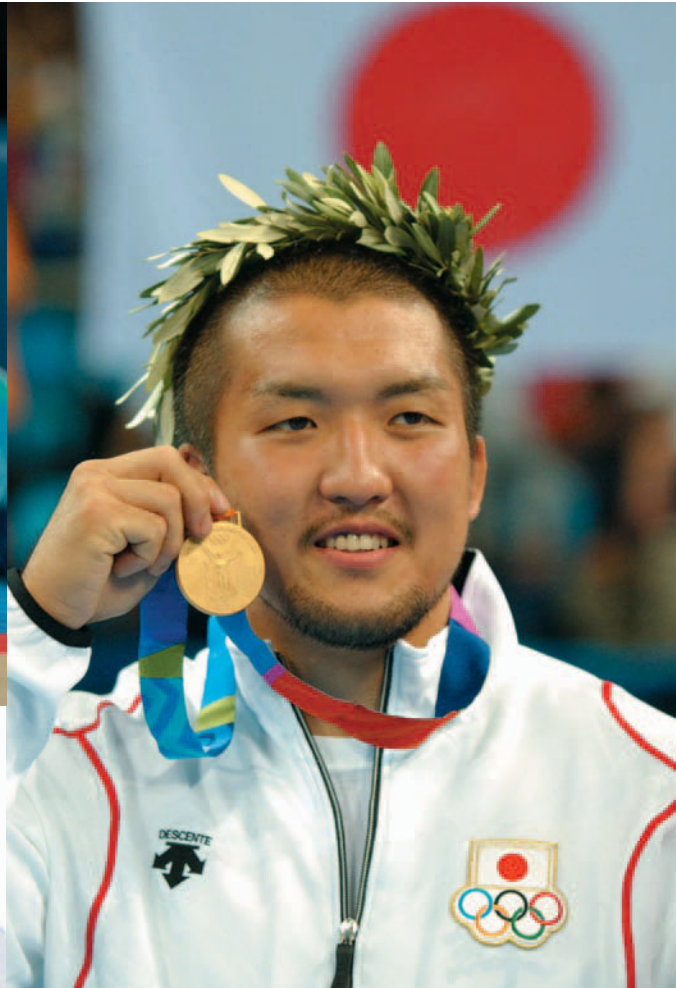
Keiji Suzuki, men's judo +100-kg gold medalist, bringing back the men's +100-kg gold medal to Japan for the first time in 16 years since the 1988 Seoul Olympic Games

"I am in the fullness of my heart. It was the last day for judo, and I had a sense that my mission was to do my best also for my comrades who lost the matches. I thought I should fight squarely."