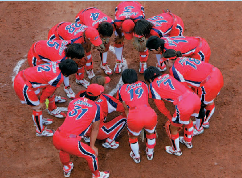
The women’s softball team won a bronze medal, the second consecutive medal following the 2000 Sydney Olympic Games, where they won the silver medal.