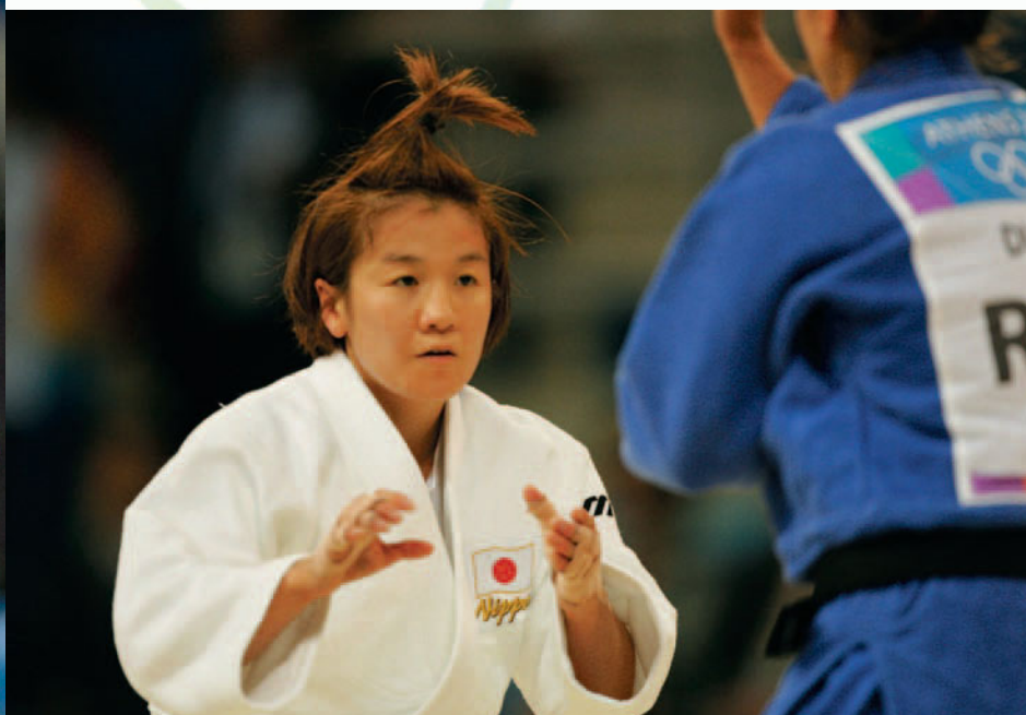
Ryoko Tani, women's judo 48-kg gold medalist, won her second consecutive gold medal following the 2000 Sydney Olympic Games.