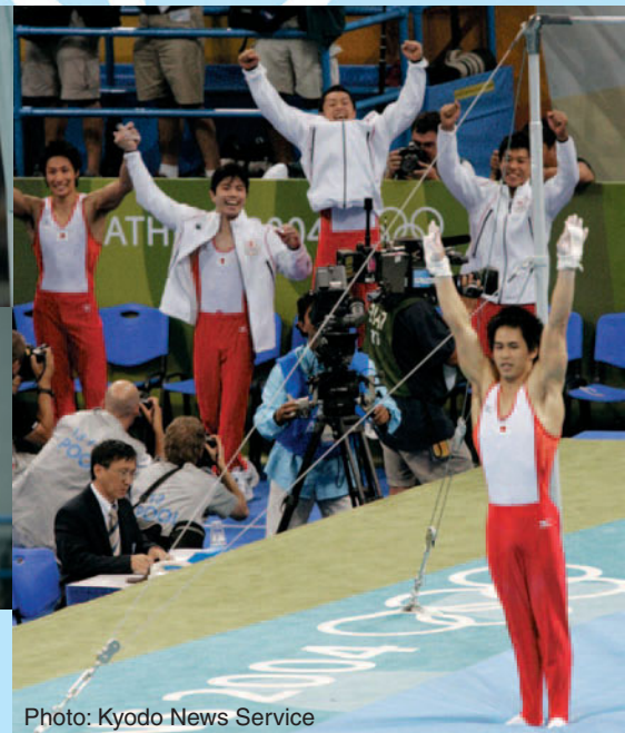
Japan's men's artistic gymnastics team winning a gold medal in team competition for the first time in 28 years since the 1976 Montreal Olympic Games