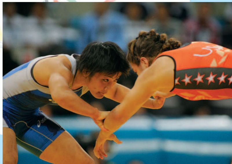
Kaoru Icho, women's 63-kg wrestling gold medalist