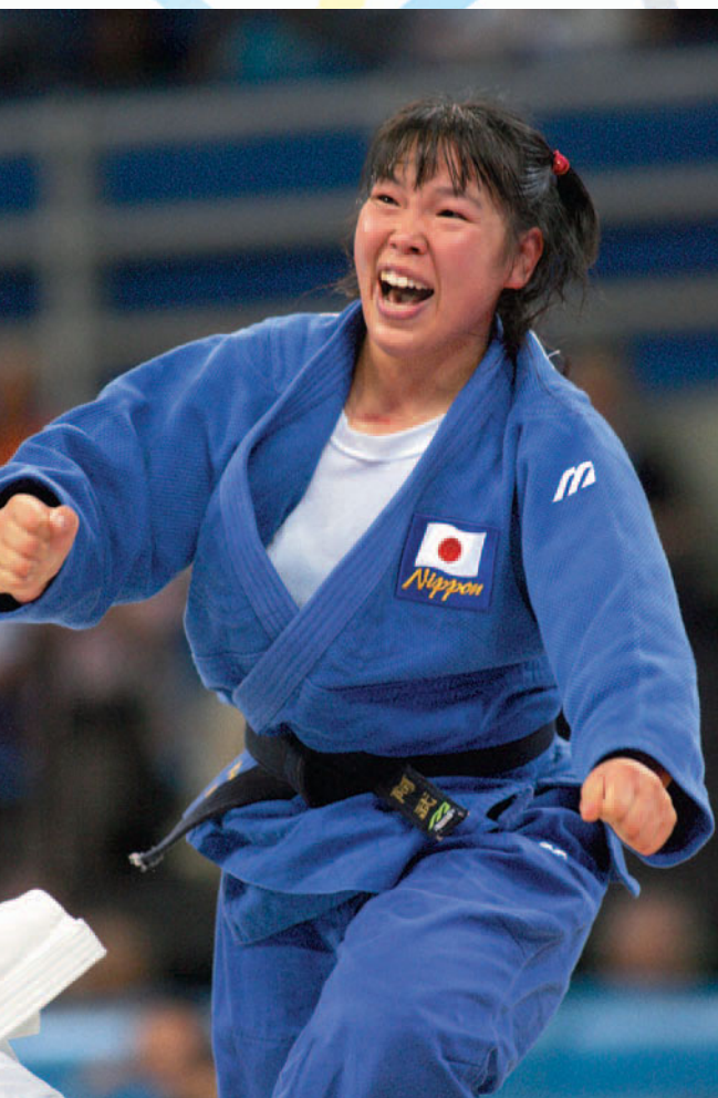
Noriko Anno, women's judo 78-kg gold medalist, finally won the gold medal at her third Olympic Games. Under the slogan of "efforts will never betray," she overcame the hardships she had at the two previous Olympic Games and finally won the gold medal.

"I am in the fullness of my heart. It was the last day for judo, and I had a sense that my mission was to do my best also for my comrades who lost the matches. I thought I should fight squarely."