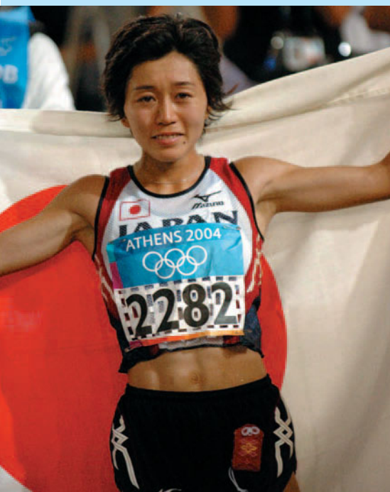
Mizuki Noguchi, women's marathon gold medalist (Japan won a gold medal in the women's marathon two consecutive times following the 2000 Sydney Olympic Games.) "I am happy. I am glad that my efforts were rewarded."