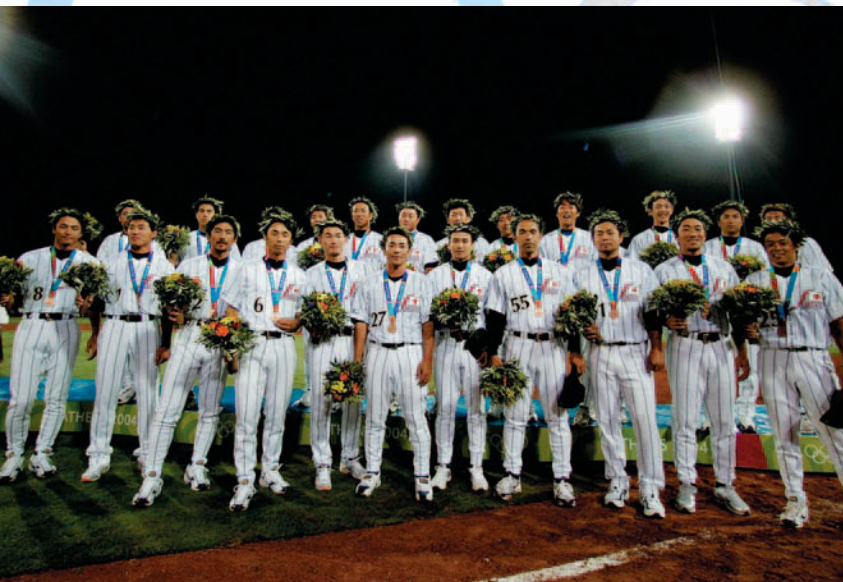
The baseball team, members of which were all professional baseball players, won a bronze medal.