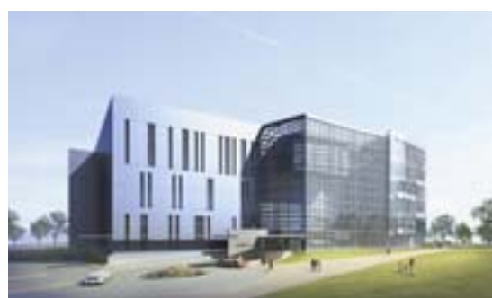
Next-Generation Supercomputer (Conceptual image)

Simulation using supercomputers is firmly establishing its position as the latest S&T technique, supplementing ongoing theoretical and experimental methods. Because supercomputers enable large-scale simulation at high speed, they are used for analysis of collisional damage of automobiles and to forecast typhoon paths, torrential rain, etc. In