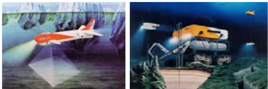
Conceptual diagram of the next generation deep-sea cruising vessel (left) and the deep-sea high-performance unmanned vessel (right) to be developed in the Next-generation Ocean Exploration Technology

In June 2009, in preparation for promoting development of unused marine resources, such as sea-floor hydrothermal deposits, etc., MEXT organized a report titled, “About How R&D Should Be in Relation to Marine Mineral Resources Exploration [literal translation].” The CST’s Subdivision on Ocean Development published this to promote development of marine resource exploitation technologies, including essential sensor and exploration technologies. In relation to the sensors and other exploration technologies, MEXT implemented the “Platform Tool Development Program for the Promotion of the Use of Marine Resources” [literal translation], aiming at promoting R&D for enabling broad and effective exploration of marine resources, including sea-floor hydrothermal deposits.