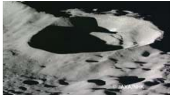
The final shot taken with the High-resolution photo-shot from the lunar explorer satellite “KAGUYA” (SELENE) (Altitude: about 14km)

Japan is promoting the scientific satellite project as one of the important R&D projects. The lunar orbiting satellite “KAGUYA” (SELENE) was deployed until June 2009 and is still analyzing the collected data to show us a variety of achievements. The Solar Observatory HINODE is also collecting solar observation data, and contributing to scientific research on the sun. In addition, Japan continuously promotes the development of projects, including the Venus Climate Orbiter (PLANET-C), the Mercury Exploration satellite (Bepi Colombo) under international cooperation with the European Space Agency, and others.