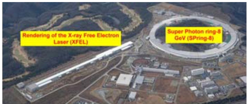
X-ray Free Electron Laser (XFEL) facility [The rectangular-shaped building at left is XFEL. The circular-shaped building is the Super Photon ring-8 GeV (SPring-8)] (January 2009)

The X-ray free electron laser (XFEL) is a light combining features of laser and radiation light, and is based on a technology facilitating analysis that was impossible with conventional measures. XFEL is expected to offer new wisdom in wide ranging S&T areas including life sciences and structure analysis at the nano-level as the bedrock of world-class research, enabling instantaneous measurement and analysis of ultra-microstructures at the atomic level and super-high-speed movement or changes in chemical reactions. RIKEN and the Japan Synchrotron Radiation Research Institute have jointly improved their facilities with the building of the synchrotron radiation facility SPring-8 at their current site. Shared use of XFEL is expected to start in FY 2011.