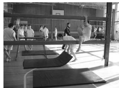
▲ Physical education class provided in the UK

According to a common physical education curriculum set for all schools, children attend traditional team game classes and competitive sports classes. The government recommends schools to set their physical education class hours at two hours a week for all grades, including hours spent in extracurricular club activities. For physical education, eight key stages are set, and the children must meet certain criteria at each of the stages. The law stipulates that at key stage 3 (for children aged 11 to 13), the achievements of children are to be evaluated at three levels and the results notified to their parents and guardians.