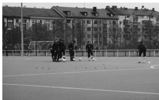
▲ Sports club in Munich, Germany

Germany has no national training center. Instead, regional sports clubs network together to form a sys-