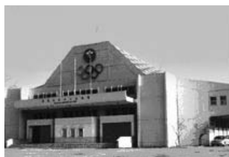
▲ Front entrance of the Taenung National Center

The Sports Bureau of the Ministry of Culture and Tourism takes charge of sports-related issues and provides various services in relation to competitive and lifelong sports activities. The Ministry of Education and Human Resources has jurisdiction over school physical education.