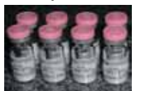
Vials containing SE36 malaria vaccine formulation produced by the Research Foundation for Microbial Diseases of Osaka University in accordance with GMP

We have established new infectious disease treatment methods by combining chemotherapy with the patient's own immune responses in order to treat infectious diseases that have not been effectively treated thus far with chemotherapy alone. We have also developed treatment methods that are effective against drug-resistant bacteria and vaccine technologies that increase the effectiveness of anti-infectious drugs.