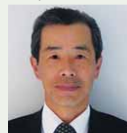
Former Director, Yamaguchi Prefectural Industrial Technology Institute