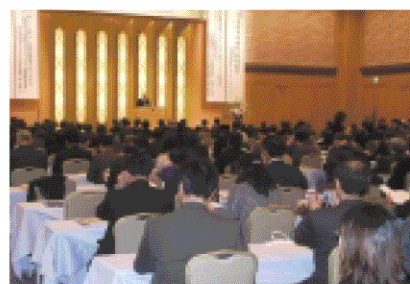
Shikoku Industry-Academia-Government Cooperative Project Result Announcement Conference (Representatives of each project announced project results promoted through cooperation between the region and both ministries)

Joint conferences to announce project results are held once a year to enable exchange of information between the participants in the related projects.