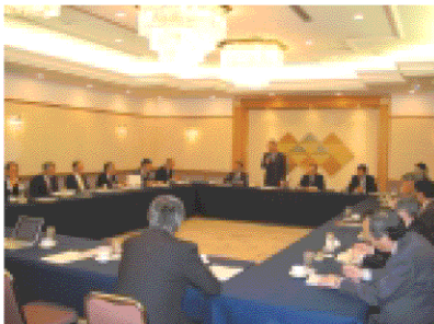
Shizuoka Science and Technology Coordinators Network Conference (All the coordinators in industry-academia-government cooperation within Shizuoka prefecture gathered.)

MEXT and METI support the core organizations in the Knowledge Cluster Initiative and the project promotion organizations of the Industrial Cluster Project, so that they will closely work together in each region.