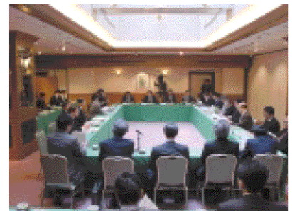
Hokkaido IT Cluster Promotion Committee (Industry, universities, local governments and both ministries discussed how to promote the programs.)

MEXT, METI, local governments and other relevant entities establish together "Committee for Regional Cluster Promotion" for each region. The Committee oversees the progress of the Knowledge Cluster Initiative and the Industrial Cluster Project, and exchanges detailed information about the cooperation policies. It is expected to be the place to discuss how to achieve close cooperation between the activities of the two ministries and coordinate them properly.