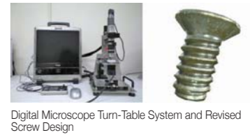
Digital Microscope Turn-Table System and Revised Screw Design