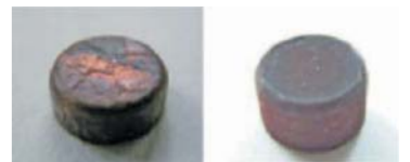
Copper Plating and Ferrite Plating