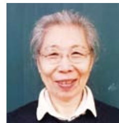
Student from the Korean Peninsula, in her 70s (current student)

I was not able to study at school because of the war. Studies should be done when people are young. People who are afforded the opportunity to study now should learn so they have no regrets.