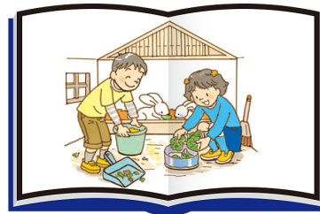
take care of the rabbits