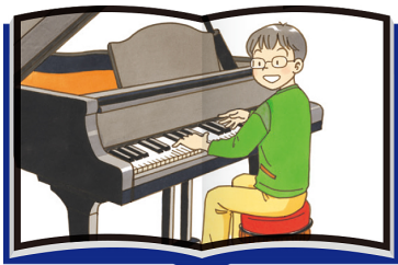
play the piano