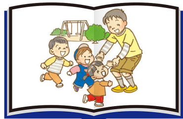
play with small children