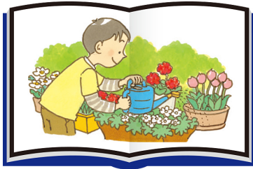
water the flowers